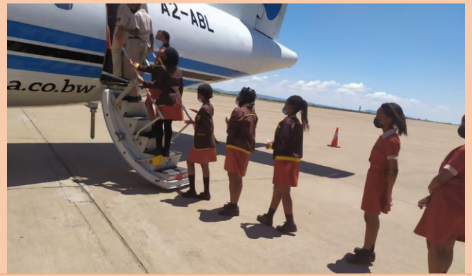
2021 Std 7 Students boarding Air Botswana's ATR 72 For a fun flight around the skies of the South Eastern Botswana