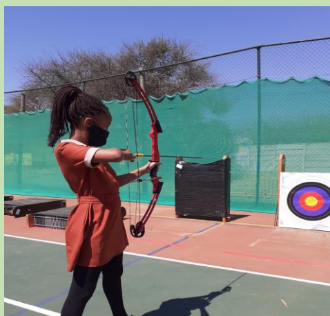
An Archer in Action:

Parents should communicate with Class Teachers regarding suitable activities and the logistics behind joining the club.